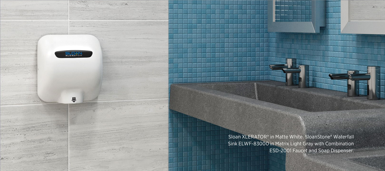
Sloan XLERATOR® in Matte White. SloanStone® Waterfall Sink ELWF-83000 in Matrix Light Gray with Combination ESD-2001 Faucet and Soap Dispenser.