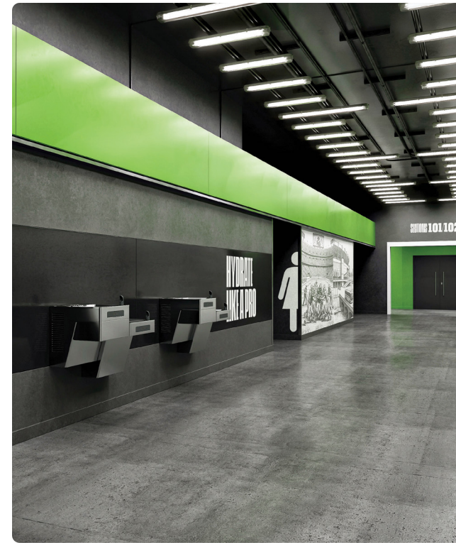
DRS125 DropSpot Bottle Filler with Bi-level Cooler and DRS125 DropSpot Bi-level Coolers are available in Stainless Steel and Black Powder Coat finish.