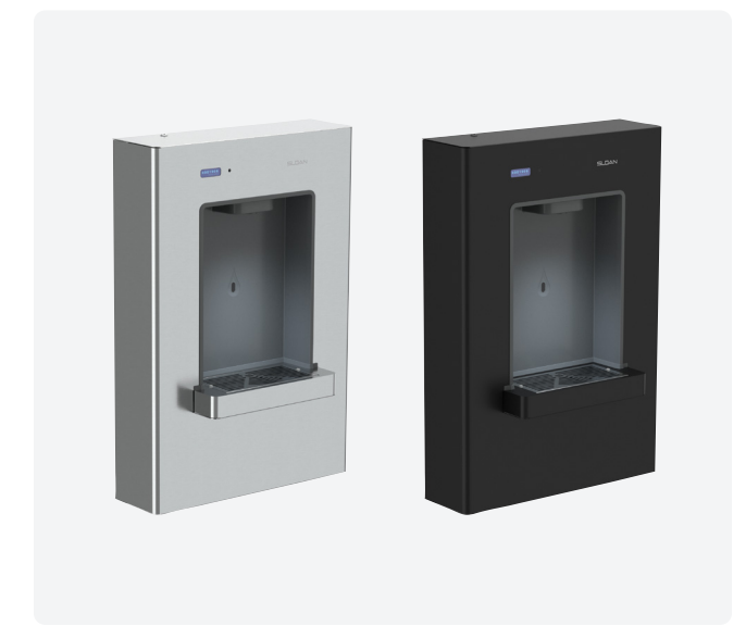
DRS100 DropSpot non-refrigerated units available in Stainless Steel and Black Powder Coat finish options