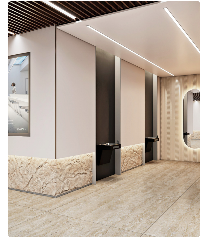
DRS115 DropSpot Single-level Cooler in Black Powder Coat finish.