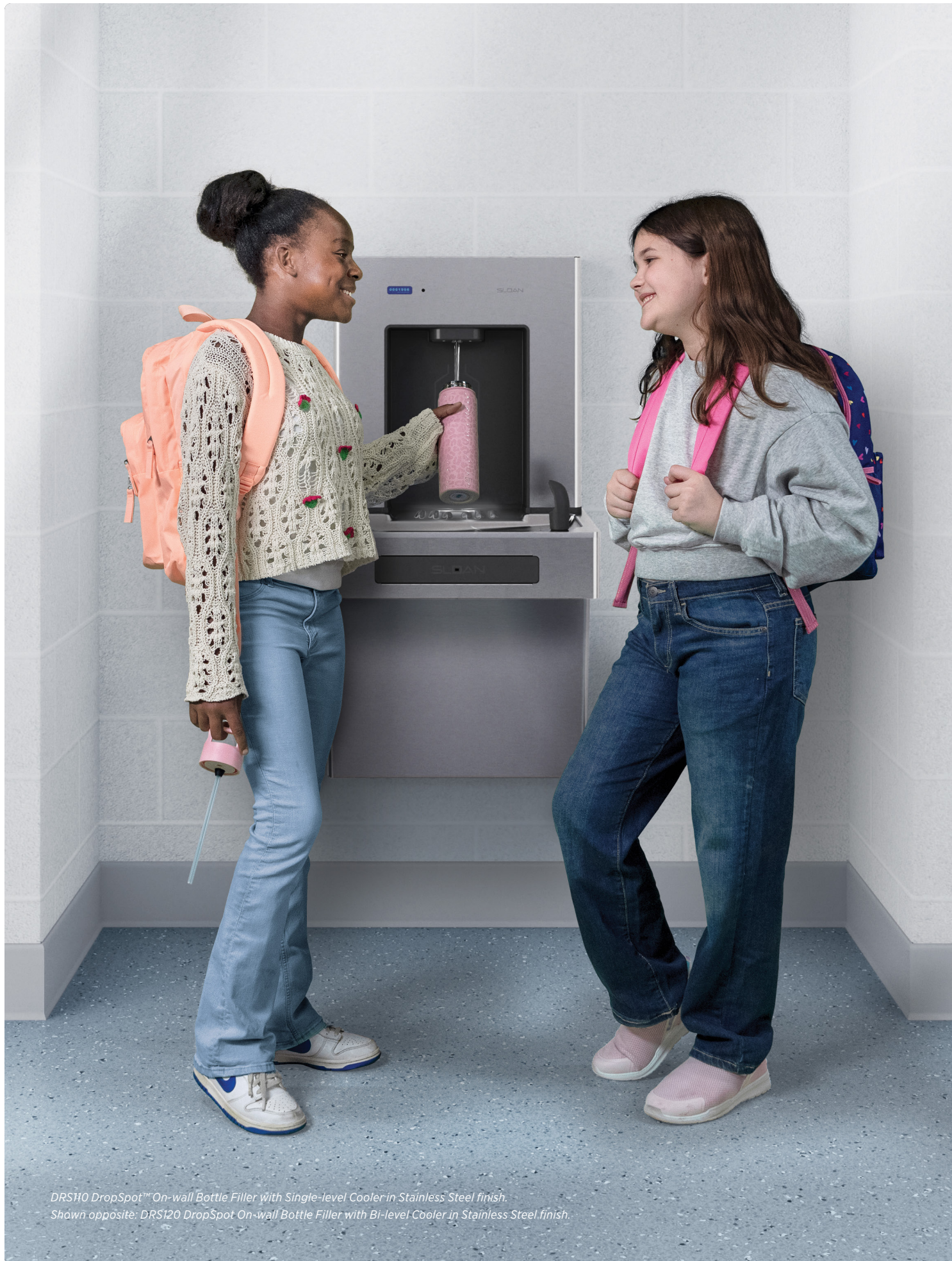
DRSH0 DropSpot™ On-wall Bottle Filler with Single-level Cooler in Stainless Steel finish. Shown opposite: DRS120 DropSpot On-wall Bottle Filler with Bi-level Cooler in Stainless Steel finish.

Sloan DropSpot™ Bottle Fillers and Water Coolers embrace style and promote sustainable drinking practices with every sip.