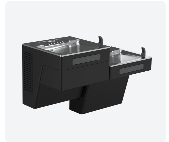
The DRS125 DropSpot Bi-level Cooler shown with high-left cooler mounting configuration and Cane Apron in Black Powder Coat finish. See page 14 for accessory information.