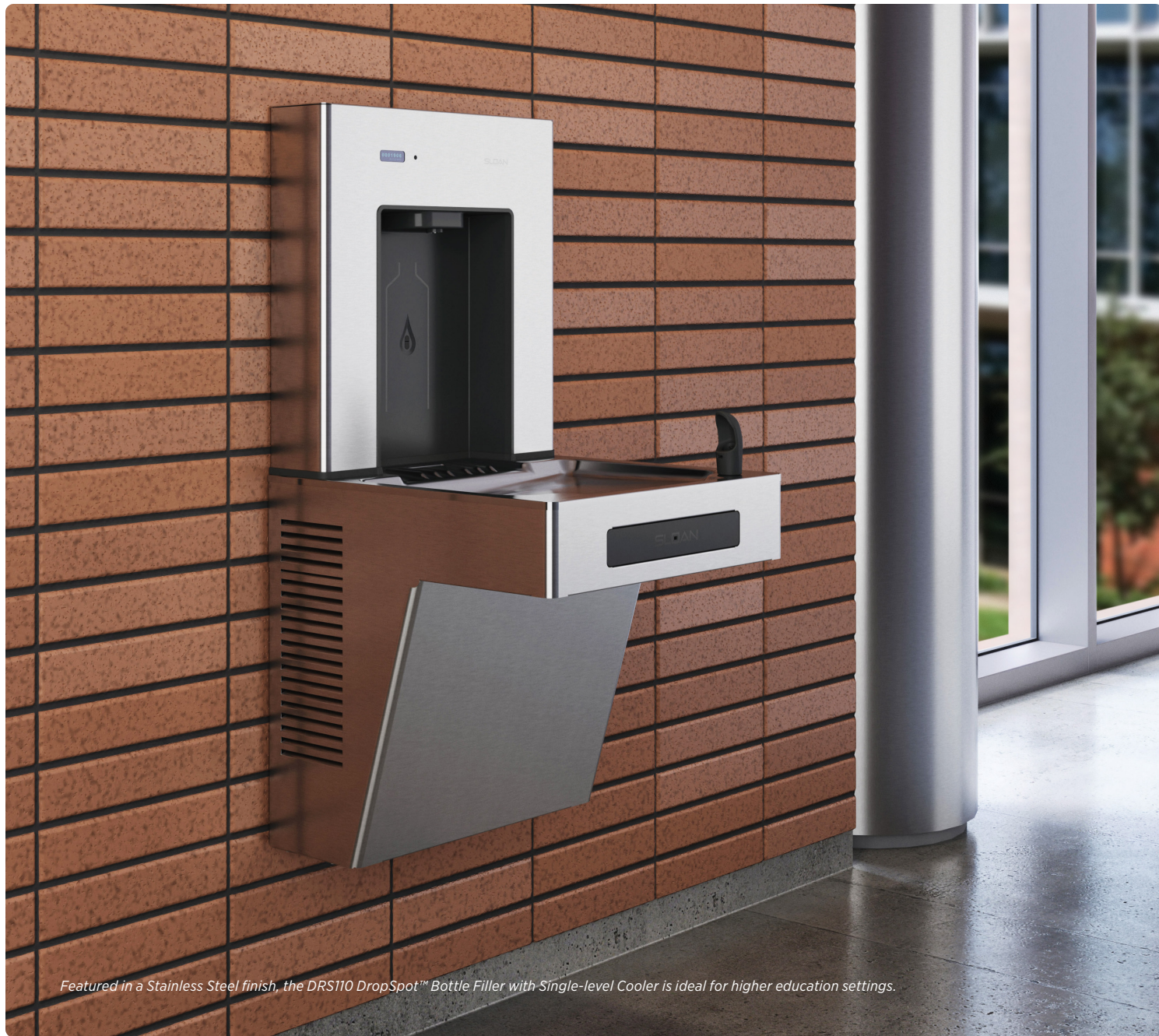
Featured in a Stainless Steel finish, the DRS110 DropSpot™ Bottle Filler with Single-level Cooler is ideal for higher education settings.