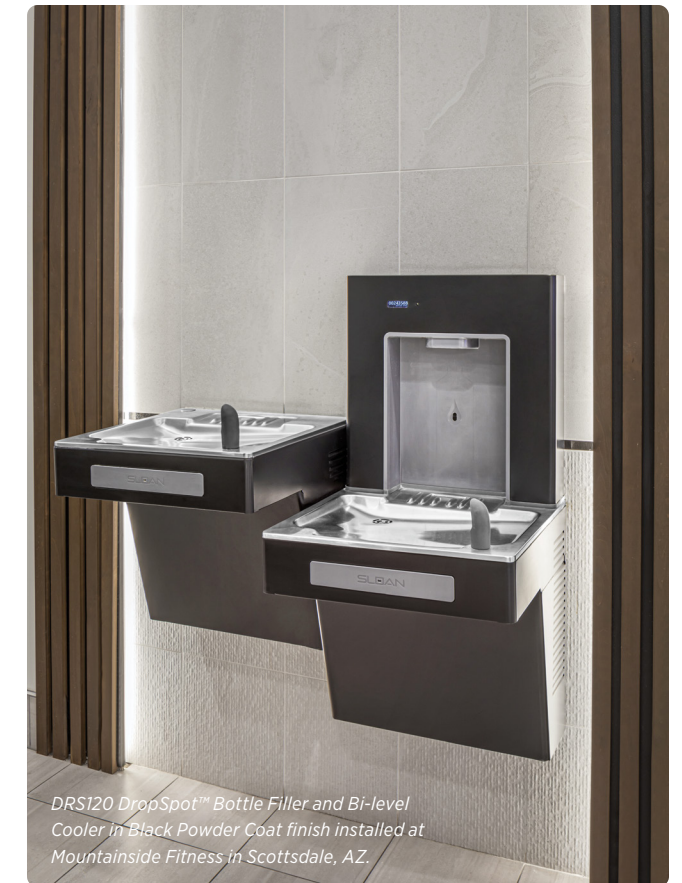
DRS120 DropSpot™ Bottle Filler and Bi-level Cooler in Black Powder Coat finish installed at Mountainside Fitness in Scottsdale, AZ.