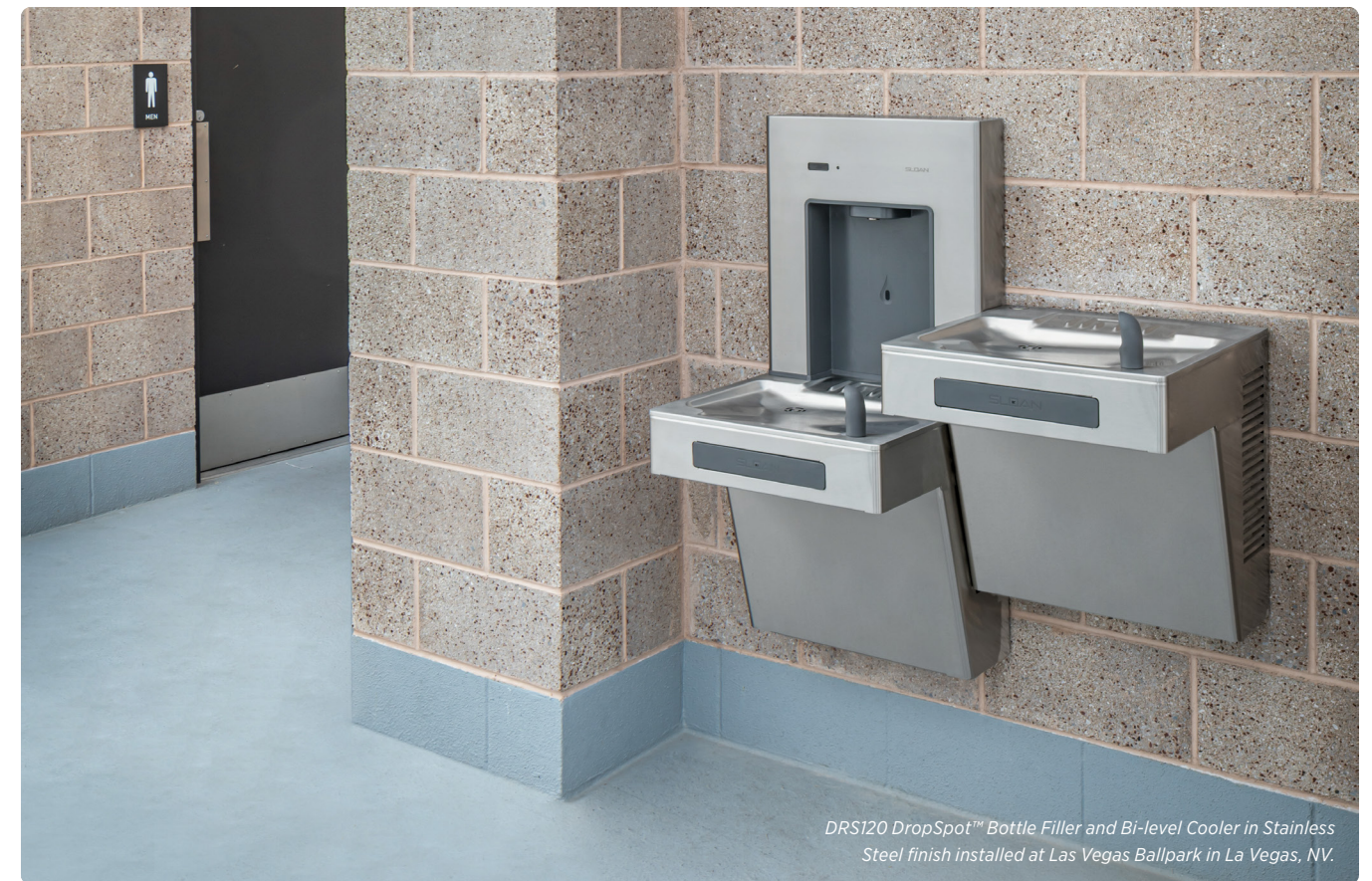
DRS120 DropSpot™ Bottle Filler and Bi-level Cooler in Stainless Steel finish installed at Las Vegas Ballpark in La Vegas, NV.