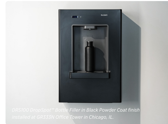
DRS100 DropSpot™ Bottle Filler in Black Powder Coat finish installed at GR333N Office Tower in Chicago, IL.

For more information on how to add Sloan DropSpot Bottle Fillers to your project visit sloan.com/dropspot or contact us at 800.982.5839