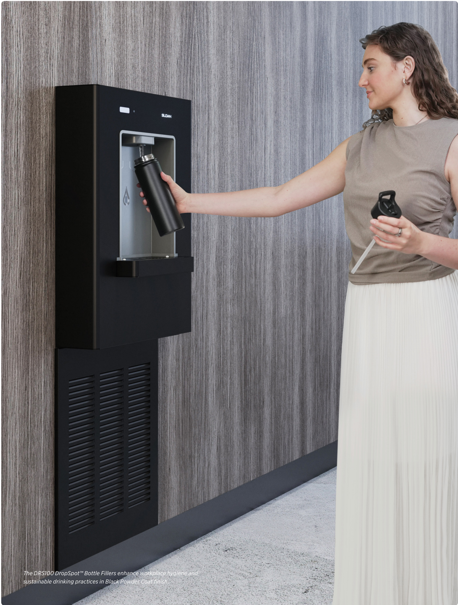
The DRS100 DropSpot™ Bottle Fillers enhance workplace hygiene and sustainable drinking practices in Black Powder Coat finish.