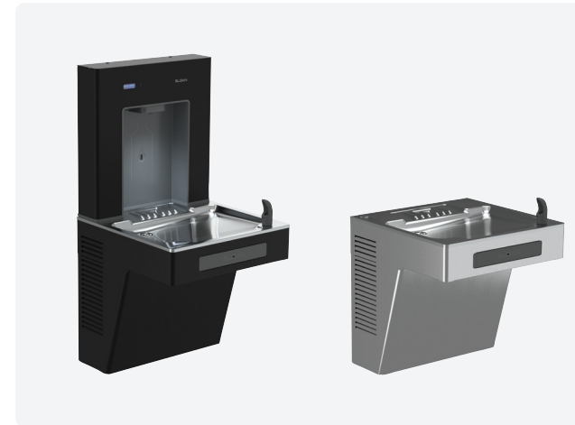
DRS110 DropSpot Bottle Filler with Single-lever Cooler and DRS115 DropSpot Single-level Cooler are available in Stainless Steel and Black Powder Coat finish.

All DropSpot Bottle Fillers and Water Coolers are certified and comply with NSF61 standards for safer drinking water consumption.