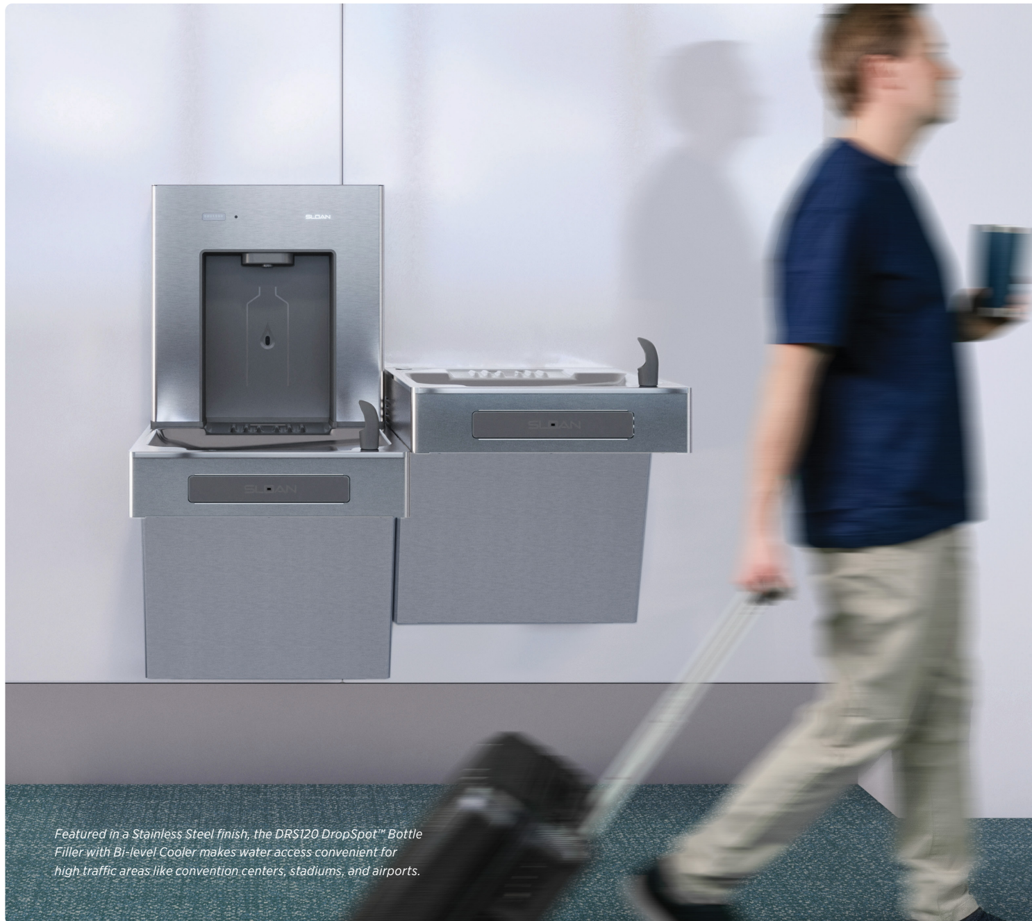
Featured in a Stainless Steel finish, the DRS120 DropSpot™ Bottle Filler with Bi-level Cooler makes water access convenient for high traffic areas like convention centers, stadiums, and airports.

Sloan DropSpot Bottle Filler and Water Coolers are built for everyone and, when installed properly, meet ADA requirements. This ensures an accessible and welcoming experience for all users. The BRS Cane Apron attaches directly to DRS120 and DRS125 Bi-level Coolers for a streamlined and accessible look.