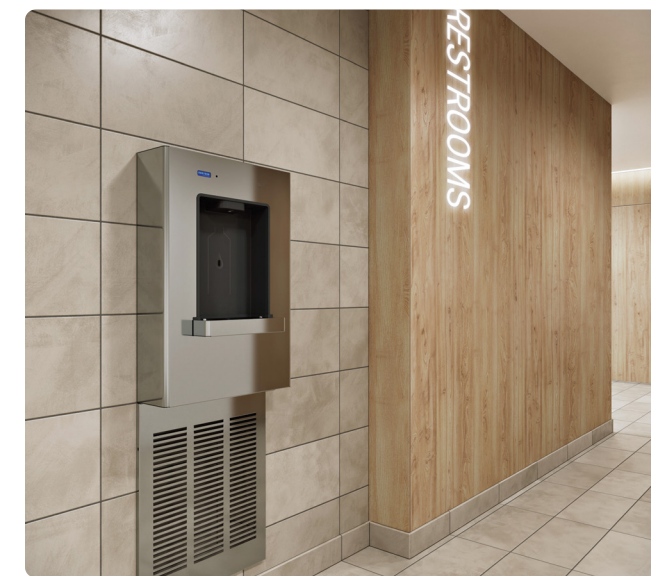
DRS100 DropSpot refrigerated units available in Stainless Steel and Black Powder Coat finish options

Add the remote chiller to the DRS100 for lasting cool hydration (see further information on page 15). This advanced refrigeration system delivers an impressive chilling capacity of 8.0 gallons per hour (gph), keeping every sip refreshingly cool at 50°F. Remote chillers are available as part of the DRS100 refrigerated unit or separately as an accessory for the DRS100 unrefrigerated unit.